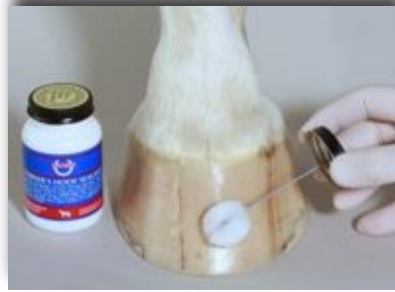
Farrier's Hoof Sealant