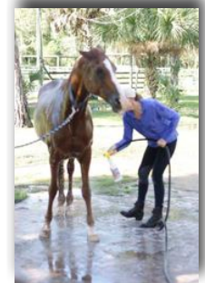
Nice N' Shiny