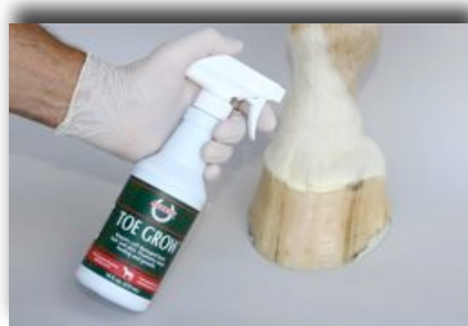
Toe Grow Spray