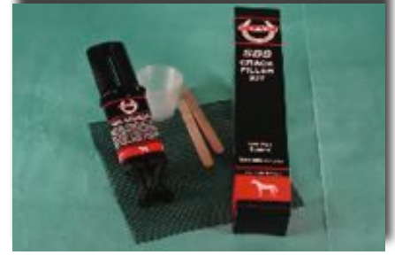
SBS Crack Filler Kit