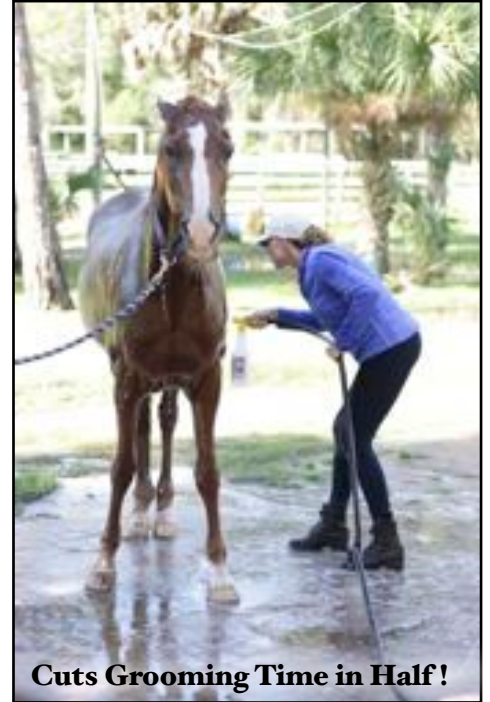
Cuts Grooming Time in Half !