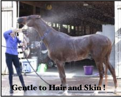
Gentle to Hair and Skin !

Using the hot tropical Everglades Ranch as a backdrop, SBS researchers have developed a hoof and body wash that helps defend against fungus, rain rot and girth itch. The anti-microbial formula is gentle to skin (neutral pH) and contains moisturizers to help prevent dryness and itchy,