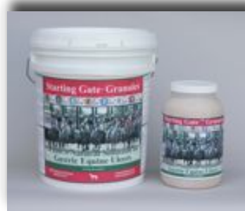
Starting Gate Granules